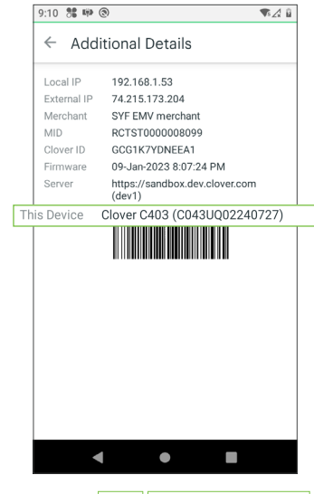
Example: C403 (C043UQ02240727) Model Serial